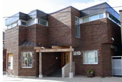
26 Vaughan Road—Sagatay (A New Beginning) Transitional Housing Facility