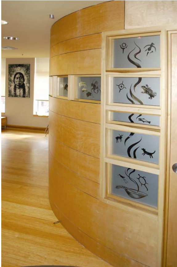
26 Vaughan Road-Sagatay (A New Beginning)—“The Gathering Room”