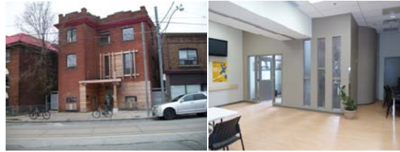
14 Vaughan Road—Men’s Shelter-Front Entrance and Meeting Room-2 nd Floor-