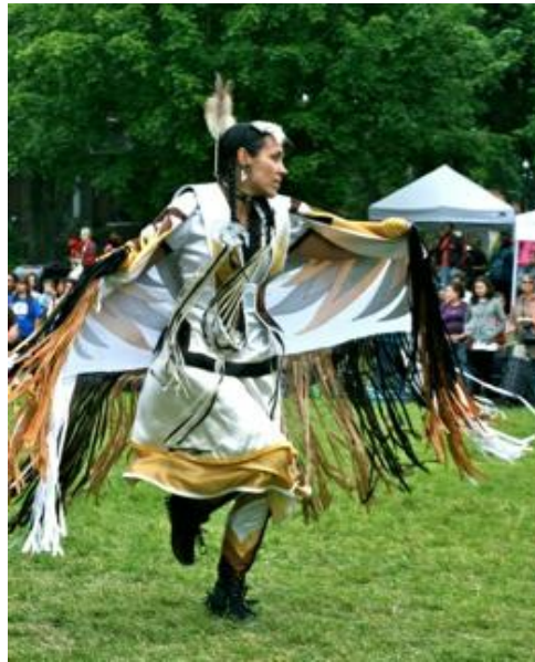
Fancy Shawl Demonstration