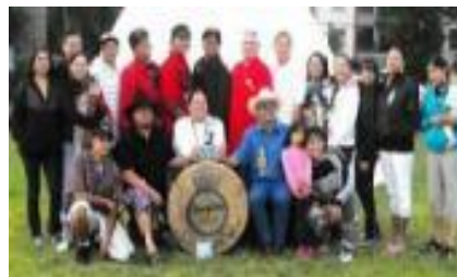
Host Drum—Chippewa Travellers