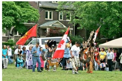
Grand Entry—Dancers Enter the Circle