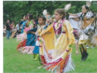
Pow Wow Dancers.