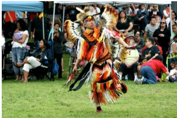
Male Traditional Dancer Demonstration