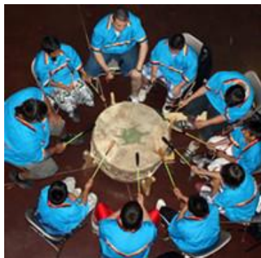
Special Drum—Red Tail Hawk Singers