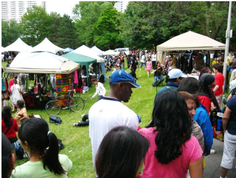
Traditional Craft Vendors and participants enjoy the day