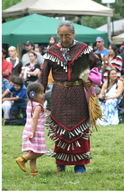
Jingle Dress Dance Demonstration