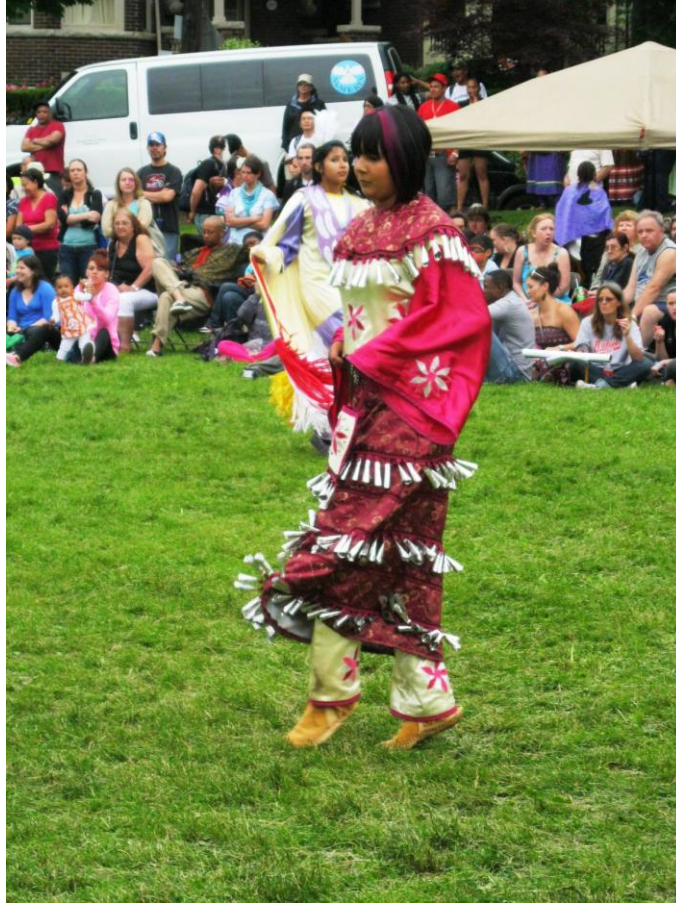
G.H. Wood Foundation donated van in background... traditional jingle dress dancer demonstrates to the crowd