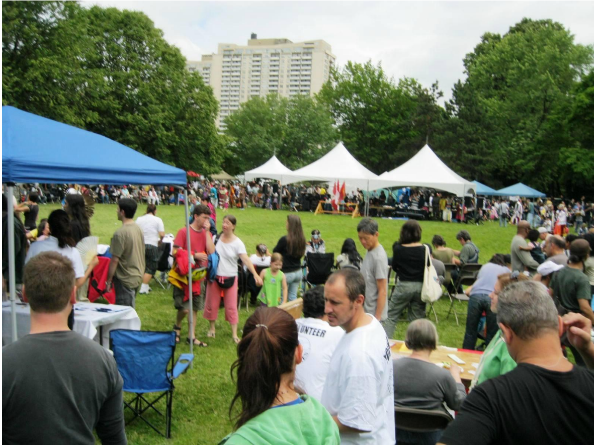
Attendees Having a great time