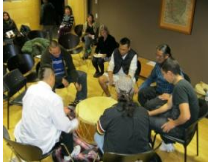
Co-Host Drum—Eagle Heart