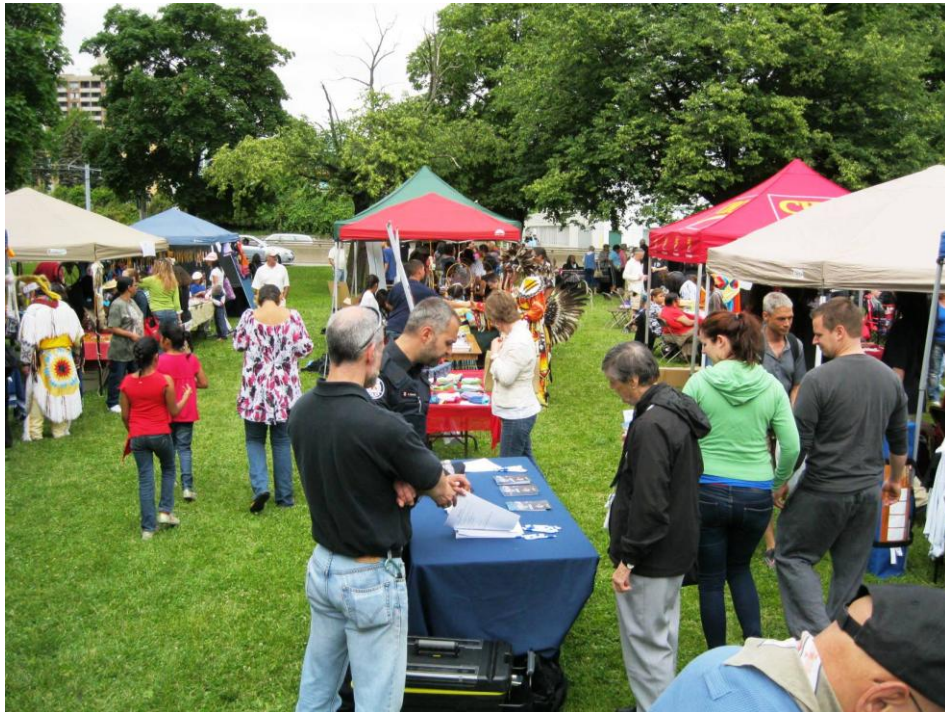
Attendees and Dancers visiting info and craft booths